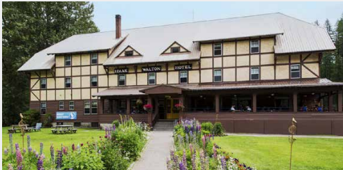
IZAAK WALTON INN Essex, MT

The Izaak Walton Inn is a historic train-themed inn in Essex, Montana, originally built by the Great Northern Railway in 1939 for lodging railway workers. In addition to railway lodging, the hotel was also originally envisioned to become an official southern gateway to Glacier National Park, although that plan didn't come to fruition. The charming Tudor Revival inn was added to the National Register of Historic Places in 1985. Interestingly, in addition to the rooms within the inn itself, some refurbished cabooses are also offered and available on most dates upon request at a higher rate.