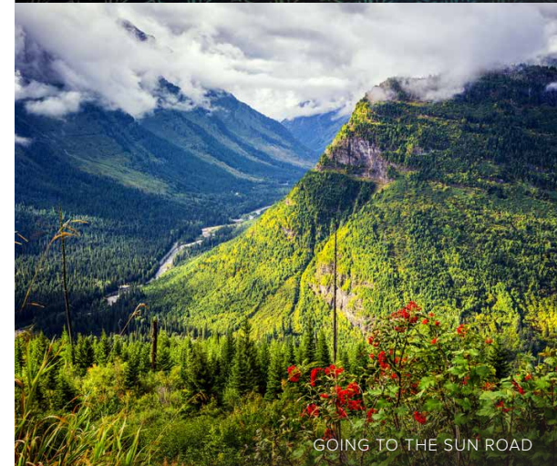
GOING TO THE SUN ROAD