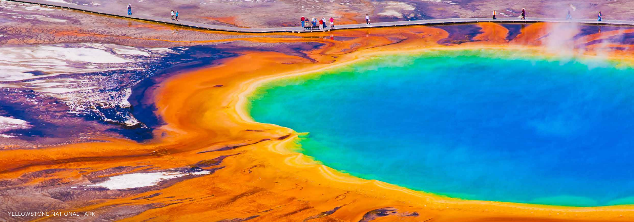
YELLOWSTONE NATIONAL PARK