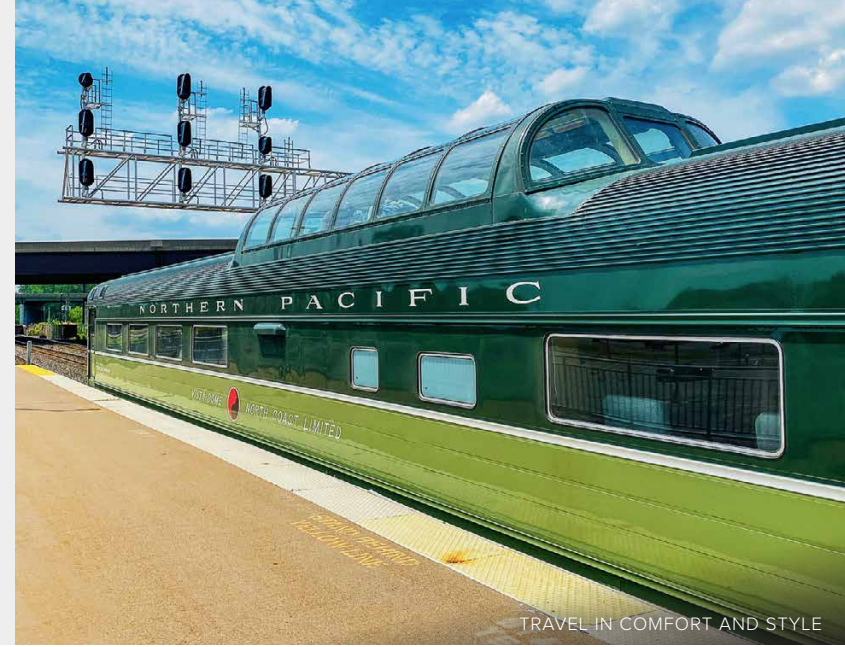
TRAVEL IN COMFORT AND STYLE

PROFESSIONAL TOUR MANAGER | Uncommon Journeys holidays are always fully hosted by a professional tour manager from start to finish to handle all the details and make your dream vacation the trip of a lifetime.