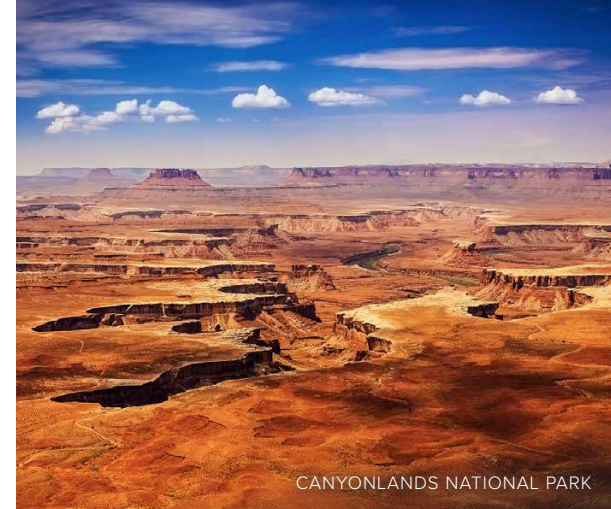
CANYONLANDS NATIONAL PARK