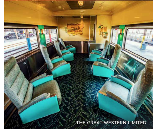
THE GREAT WESTERN LIMITED