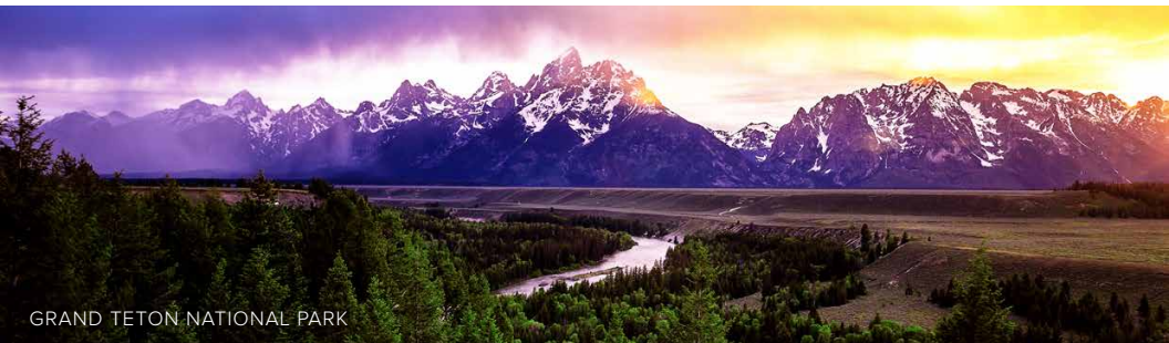
GRAND TETON NATIONAL PARK

UNCOMMON JOURNEYS | DISCOVER WHAT MOVES YOU